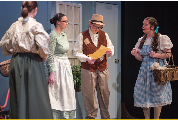
Live entertainment is back! Galway High Drama was thrilled to perform The Wizard of Oz in the recently renovated auditorium in front of live audiences.