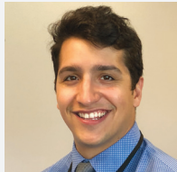
Jack Hogan Elementary School Counselor